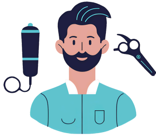
a Hair Stylist