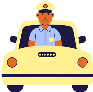
a Taxi Driver