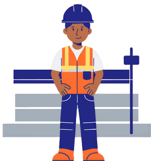
a Construction Worker