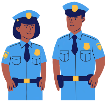
a Police Officer